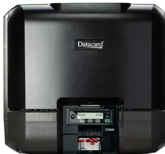
Datacard® CD800™ Card Printer with optional multi-hopper