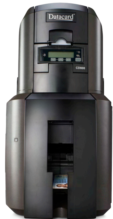
Datacard® CD800™ Card Printer with inline lamination module