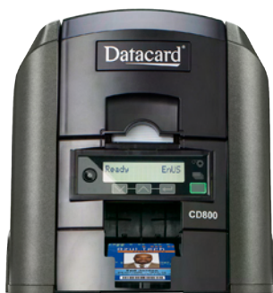
Datacard® CD800™ Series Card Printer