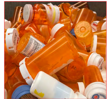
Destroy a wide range pill bottle sizes up to 16 oz. including lids. Accepts wet or dry bottles