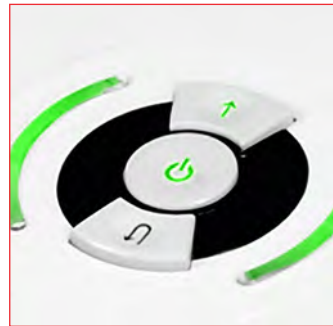
Dynamic Load Sensor shows users if they are feeding items at the appropriate rate or if they should feed faster or slower