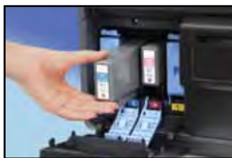
Simple ink cartridge replacement

*Specifications subject to change without notice.