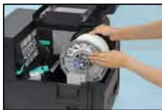
Easy label roll replacement